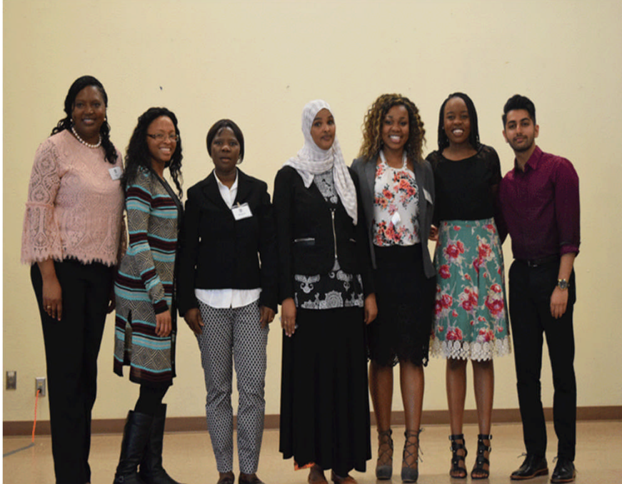
MMPNO 67 th Annual Reception Scholarship Recipients 2017

This will be an informal time to become acquainted with MMPNO members and other African-Heritage Nursing students in the Puget Sound Area.